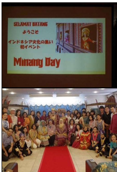
Image 1. Rumah Budaya Indonesia in Jepang on the 2017 "Minang Day" Event