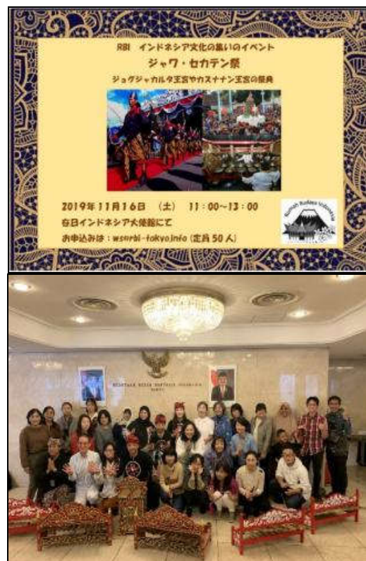
Image 2. Rumah Budaya Indonesia in Japan on "Workshop Gamelan Bali" 2019