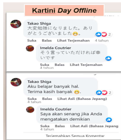
Image 9. Appreciation and a Thank You messages from the Japanese