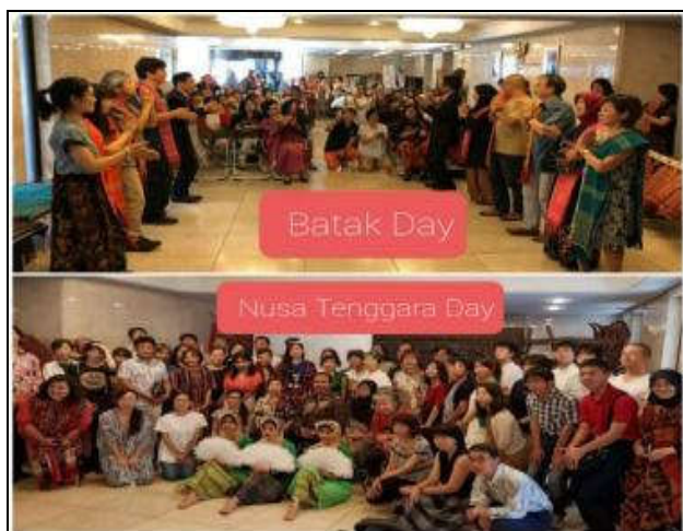
Image 5. Rumah Budaya Indonesia in Japan on "Batak Day" 2018 and "Nusa Tenggara Day" 2019