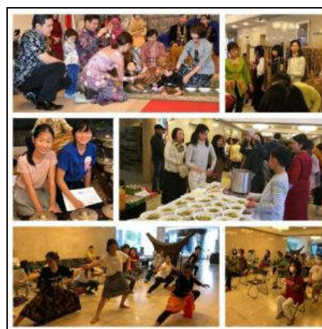
Image 6. The Japanese’s Enthusiasm at RBI’s Offline Workshops from 2017-2020

Source: Rumah Budaya Indonesia 's official Facebook Account