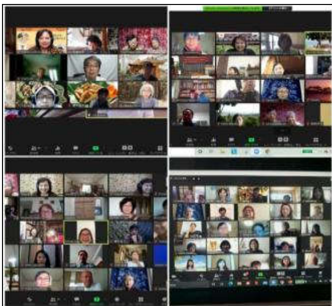
Image 7. The Japanese's Enthusiasm Participating in RBI's Online Workshops