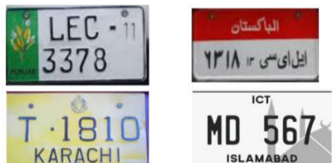
Figure 1. Common designs in Pakistan

After obtaining a good quality image of the scene/vehicle, then the core dependence of any ANPR system is on the robustness of its algorithms. These algorithms need very careful consideration and require thousands of lines of software coding to get desired results and cover all system complexities. As a whole, a series of primary algorithms are necessary for smart vehicle technologies and ANPR to be effective. The image taken from the scene may experience some complexities depending upon the type of camera used, its resolution, lightening/illumination aids, the mounting position, area/lanes coverage capability, complex scenes, shutter speed, and other environmental and system constraints. There is a variety of number plate designs are available in Pakistan, a few of them are shown in Figure 1.