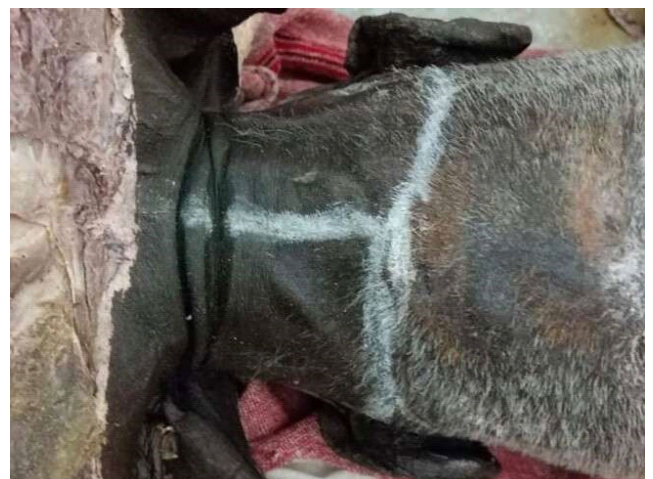
Fig. 1. Incision on the cadaver